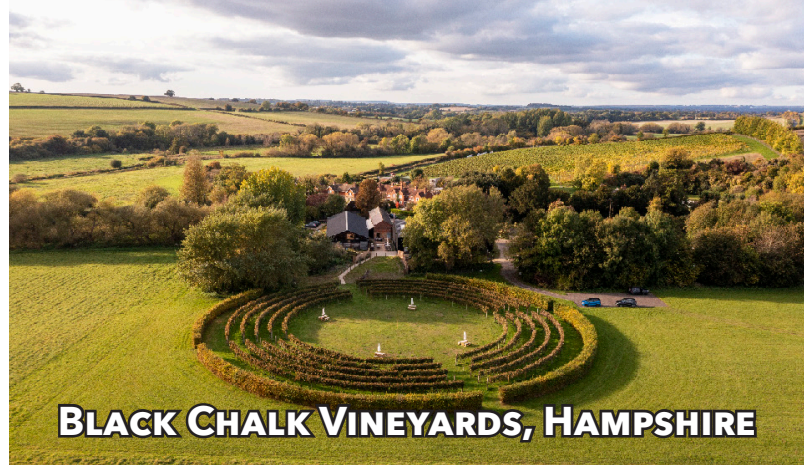
BLACK CHALK VINEYARDS, HAMPSHIRE