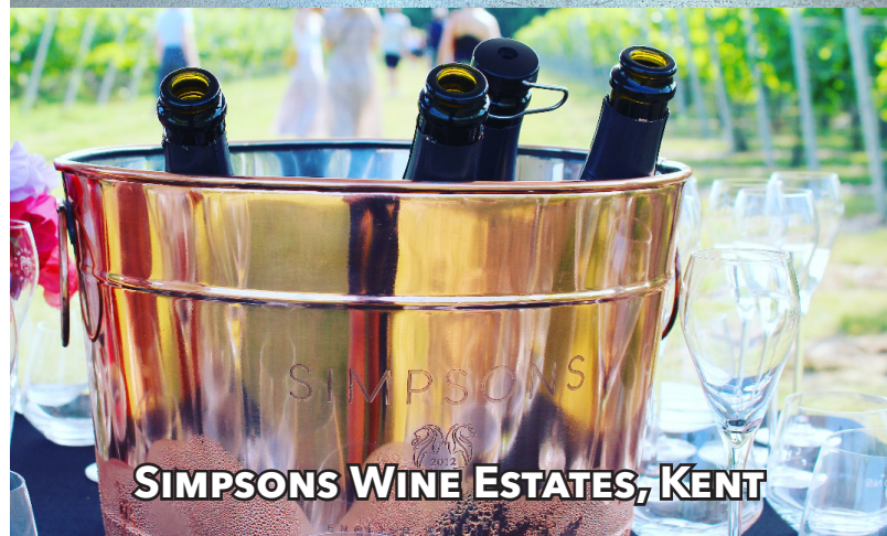
SIMPSONS WINE ESTATES, KENT