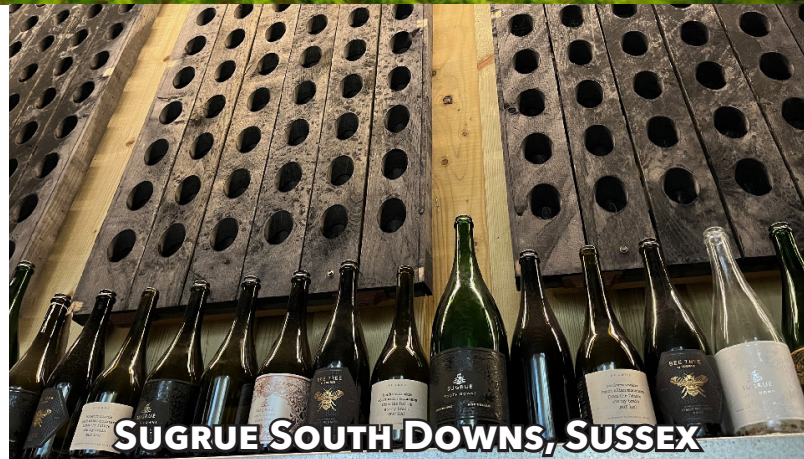
SUGRUE SOUTH DOWNS, SUSSEX