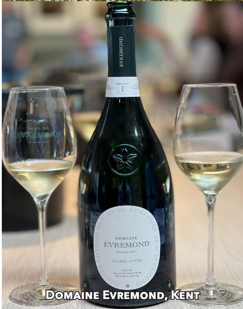
DOMAINE EVREMOND, KENT