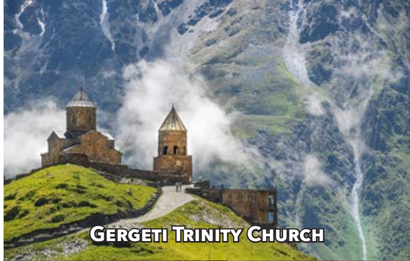
GERGETI TRINITY CHURCH