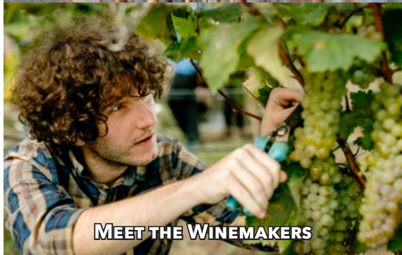
MEET THE WINEMAKERS